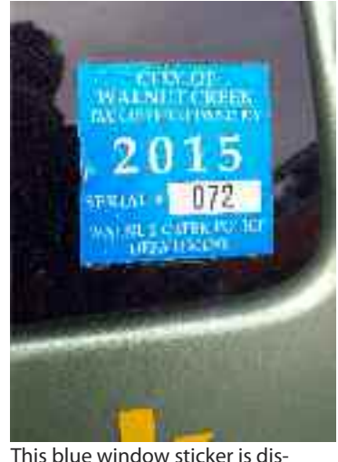
This blue window sticker is displayed on taxis that have been inspected by the City of Walnut Creek.